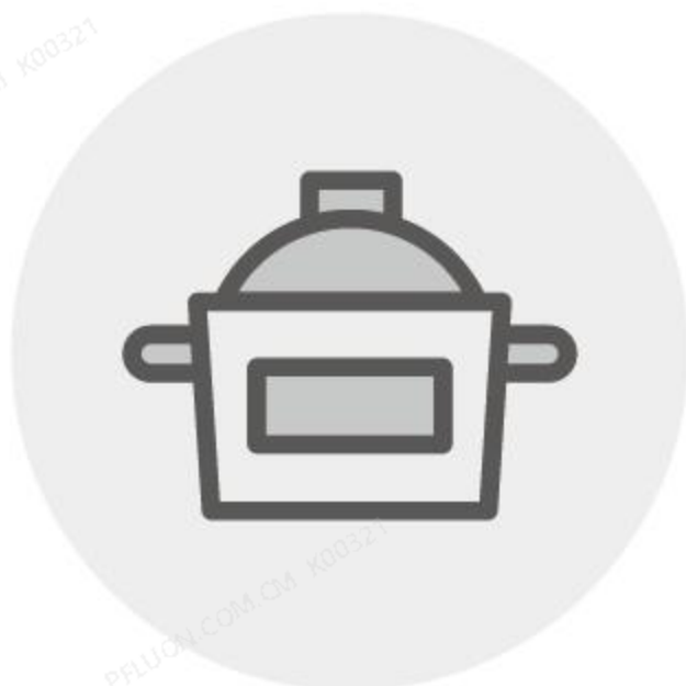
汤锅 Soup Pot