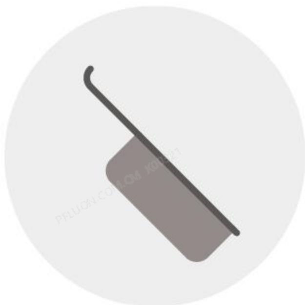
煎锅 Fry pan

低温固化，水性环保；高硬度，高耐磨的超级不粘陶瓷涂料，专用于高端不粘炊具市场。 Low curing temperature, water based (No PTFE、No PFAS); High hardness and abrasion resistance with superior non-stick property, specially used for high-end cookware market.